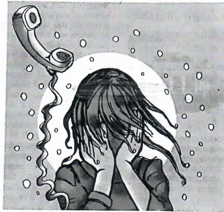
■ ILLUSTRATION: SEBASTIAN FRANCIS

"We think people perhaps are under the impression that they can discretely conduct child marriages during lockdown and nobody in their village or town will get to know," he said.